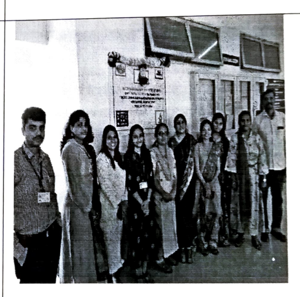
All microbiology staff members