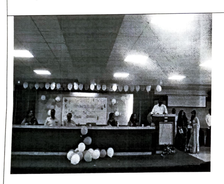
Guest of Honors